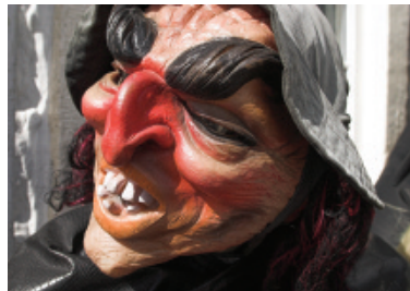
An imaginative likeness of a local witch outside Witches Galore at Newchurch in Pendle.