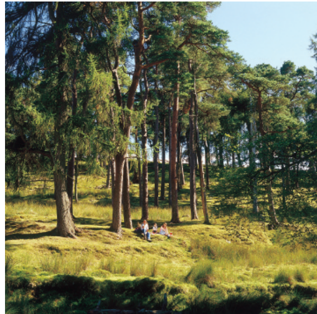
Picnic in an ancient woodland setting by Marshaw Wyre.