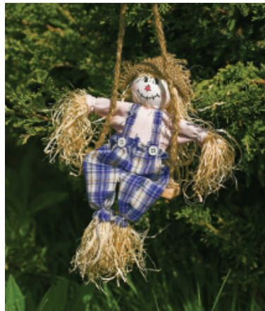
Wray Scarecrow Festival.