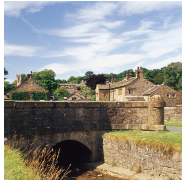
Bridge over Downham Beck.